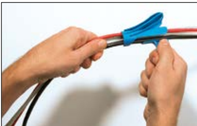
Insert one or more cables into the insertion slot of the applicator tool.