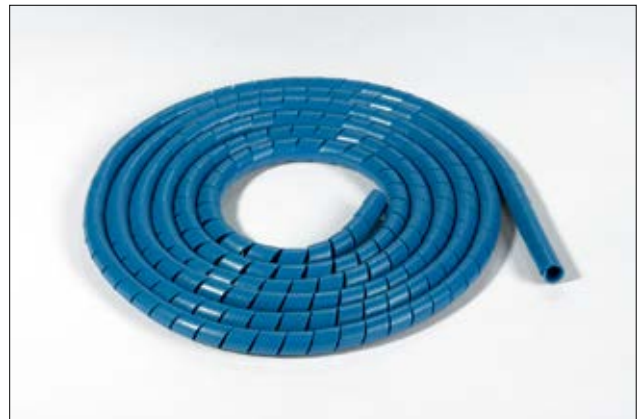
SBPEMC metal-content spiral binding.