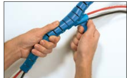
Simply slide the applicator tool through the Helawrap cover.