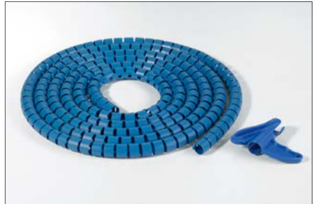
HWPPMC metal-content cable cover.