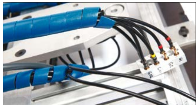
Detectable, metal-content spiral binding protects cables on food-processing machines.