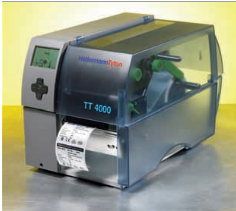
TT4000 series printer.

The ribbons are attuned to the various label materials to reach the high quality print matching the industrial needs.