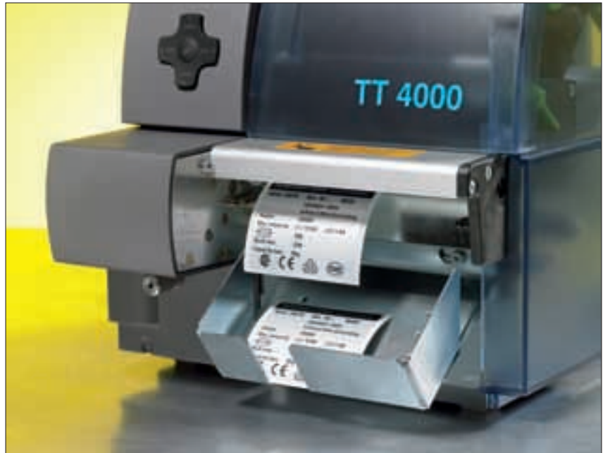
S3000 TIPS Cutter and Cutter Tray – mounted to the printer.