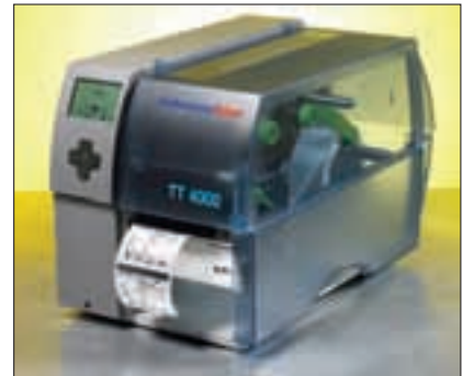
TT4000 series printer.