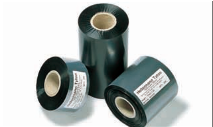
Ribbons - TTRA, TTRC+.

The range of ribbons has been designed to give maximum print clarity and performance. Material can be handled immediately after printing, enabling the printed tubing to be immediately applied without a secondary mark stabilising operation.