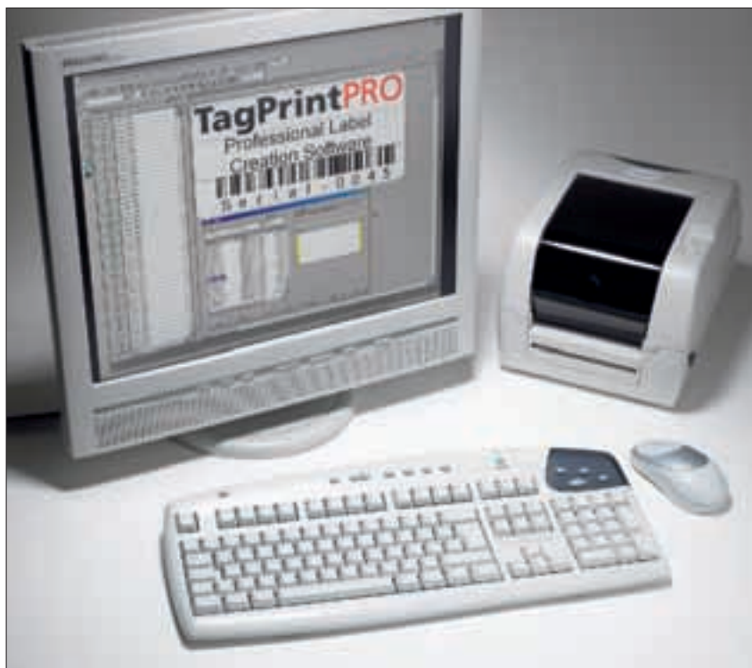
TagPrint PRO Label Creation Software.

TagPrint PRO can be utilized with HellermannTyton's wide array of label options including laser, ink jet, dot matrix and thermal transfer printable labels.