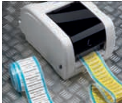
TT420 series printer.