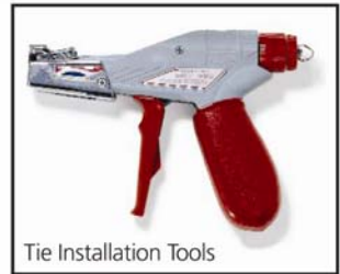
Tie Installation Tools

Being a UK manufacturer has allowed HellermannTyton to develop a number of customer specific products. These have been based on a requirement for temperature, strength, UV resistance, size and colour, to name just a few. Combined with our extensive range of fixing products, we can provide a solution in the most difficult of applications.