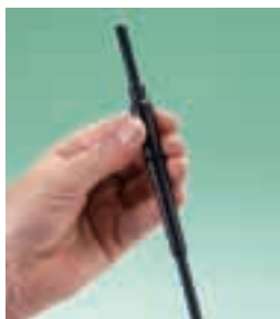
(3) Slide on Cablelok™ seal