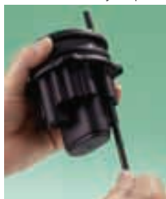
(2) Feed through cable