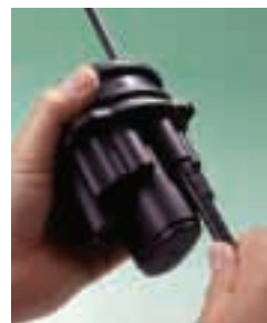
(4) Pull back to correct position