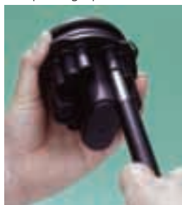
(1) Punch out base hole with port tool

The photographs below illustrate the assembly steps: